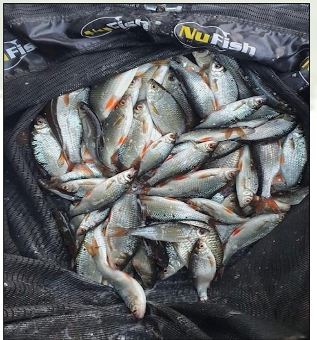
5lb 13oz from the Benbridge for Kevin Acres