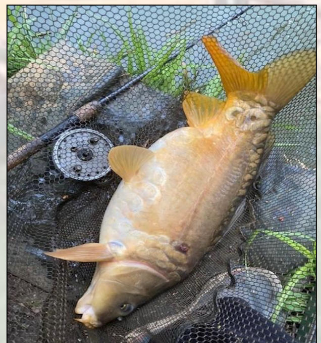
Couple of stunning fish for Carl Pearsall