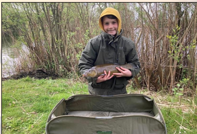
With the rod going straight back out onto the spot it wasn't long before Ren was doing battle with a Tench.